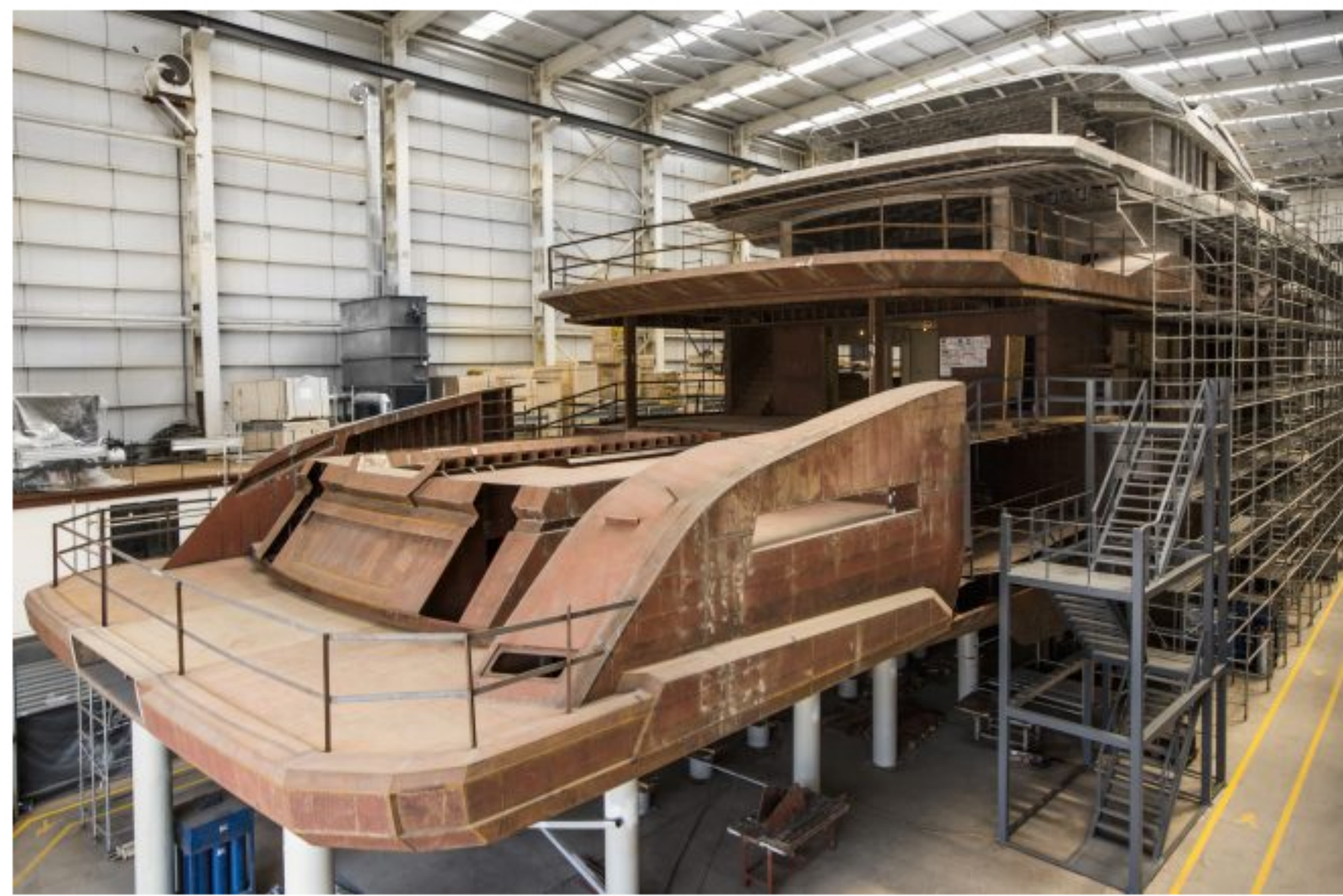
M/Y DAY'S, the first ICE Yachts hull, under construction

“Able to accommodate up to 12 guests, luxury yacht DAY'S contains an upper deck dedicated to the owner which contains two en-suite bathrooms, two walk-in wardrobes, a gym and massage room.”