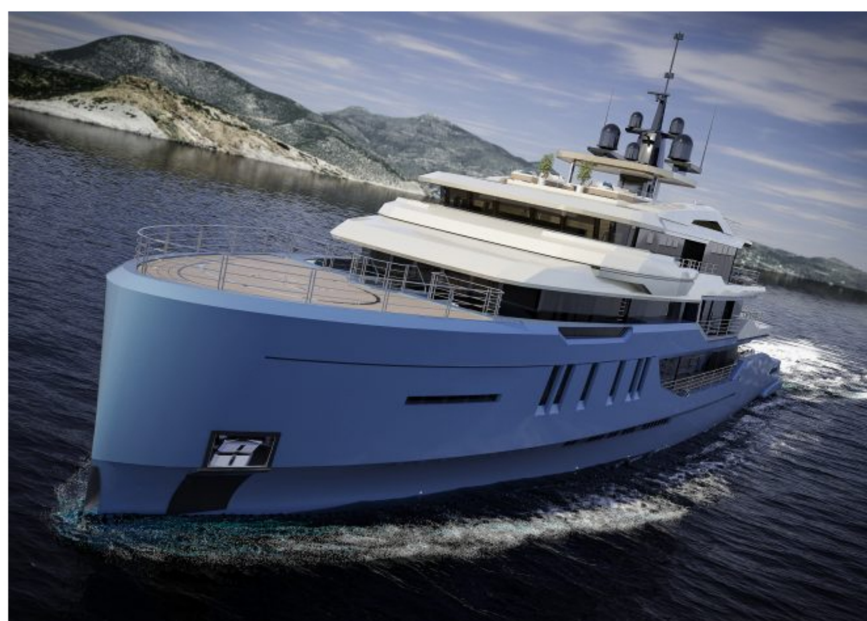
68m/223ft luxury yacht DAY'S

The generous internal volumes exceed 1,800 GT and the interiors use a minimalist design where natural light is a key design element, presenting the opulent materials at their finest.