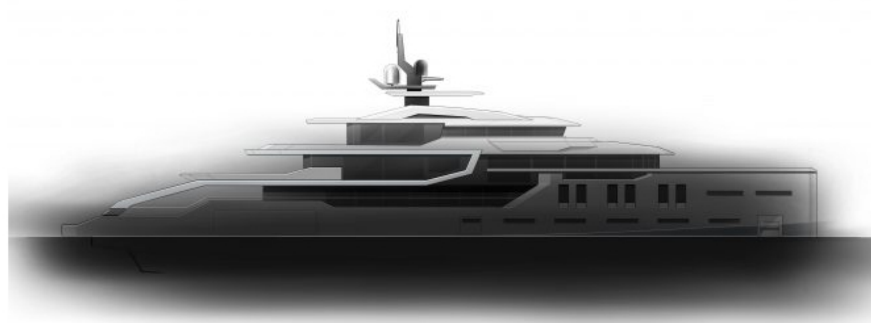
Profile of the 75m ICE Yachts hull