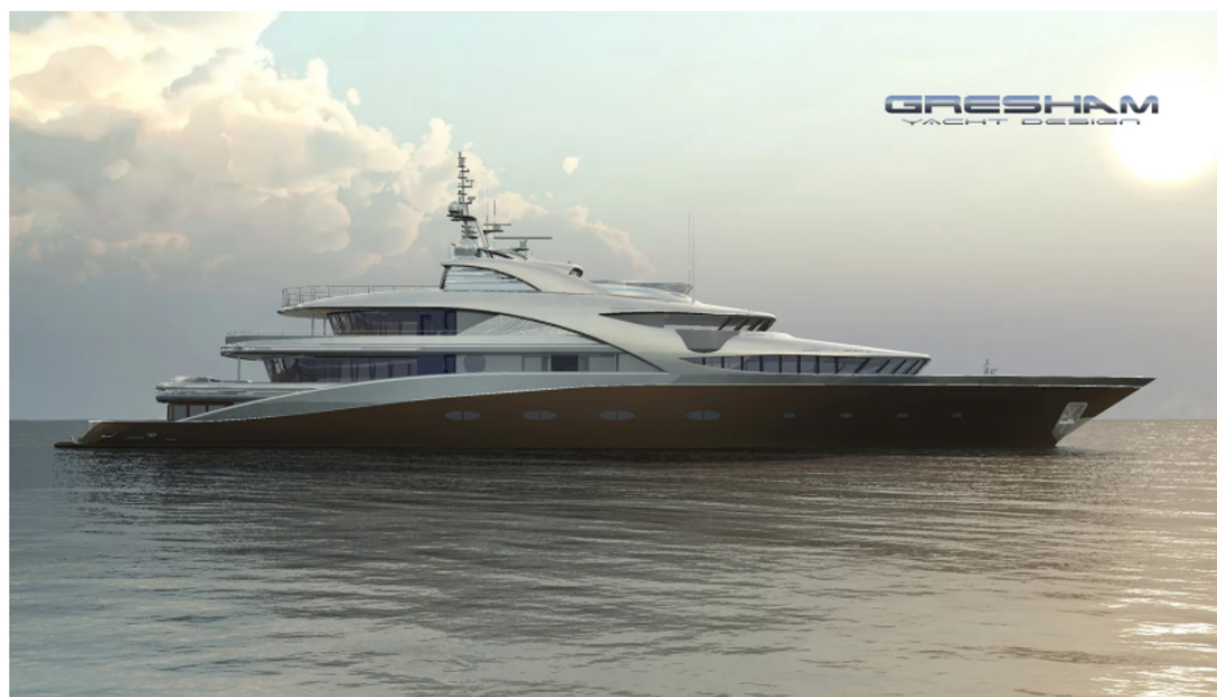
Victoria has an 11.4 metre beam and a maximum draught of 3.8 metres

The project was eventually transferred to Italy and then on to Turkey for completion, working to Lloyd's and MCA standards. The first images from the launch suggest a white hull, but it is understood that this is a covering that will be removed to reveal a metallic grey finish, as the rendering below confirms.